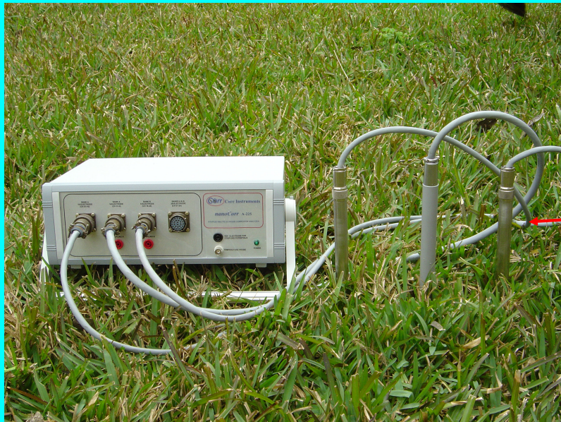
Data are transmitted to Control Station via Wireless Ethernet